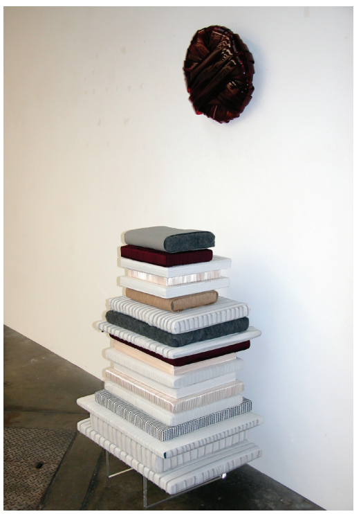
Stack Series 1. (19 parts), 2011 elastic, felt, wooden frames, staples

Although the process is repetitive, the finished works develop a surface of random patterning each one individual, and at same time remain a cohesive cluster. The installation features wall works and floor stacks, creating a sense of serialisation, with a subtle randomness. The floor stacks are connected to the wall works by sharing of the materials and developing an overall connecting coherence.