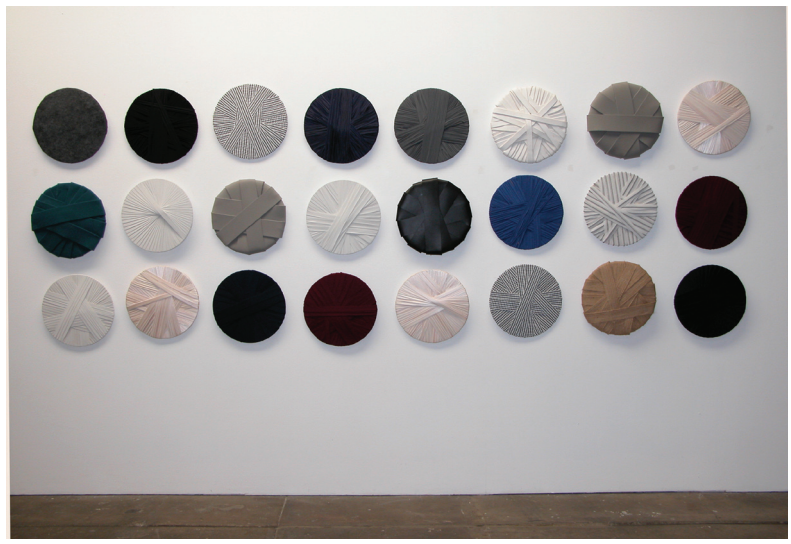
Reveal / Conceal Series 1 – 24, 2011 elastic, cotton tape, wood, felt, staples