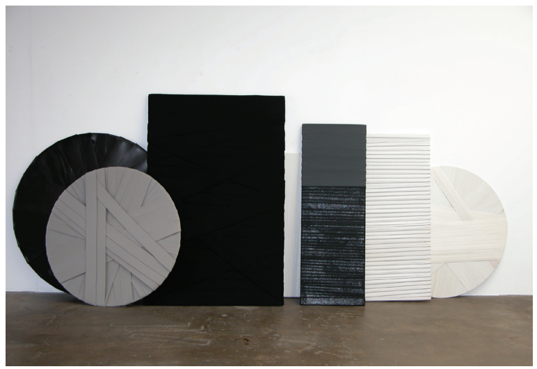
Assemblage (7 parts), 2011 elastic, wood, staples

The exhibition Revelation through Concealment, is concerned with covering up the surface and revealing a new one. Marlene Sarroff 's work is always strongly influenced by materials and process and this exhibition departs from previous work, only in her change of both the process and the material used. This new body of work features elasticised material. Elastic and flexible materials are stretched and wound in a rotating motion around and over the entire circular, square and rectangular shapes.