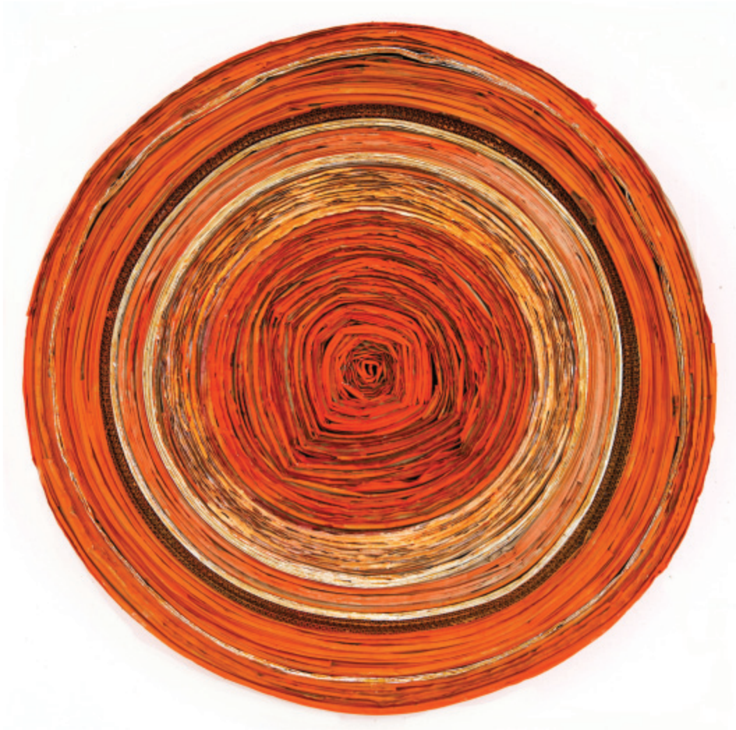
Orange Spiral Cluster 1 2007