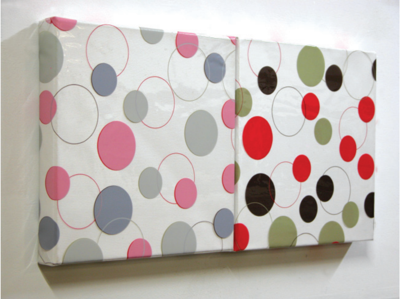
Variations on a still line 5a and 5b 2009