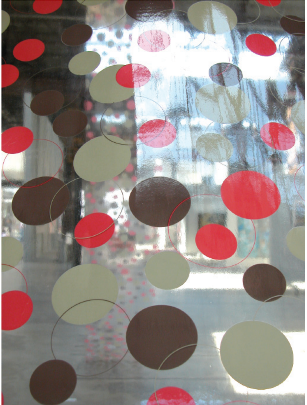
Volume #2 (detail) 2009