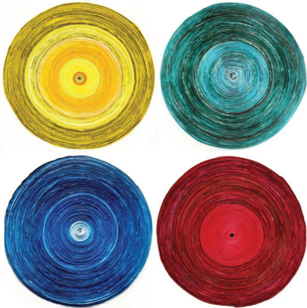
Yellow Spiral Cluster 1 2007