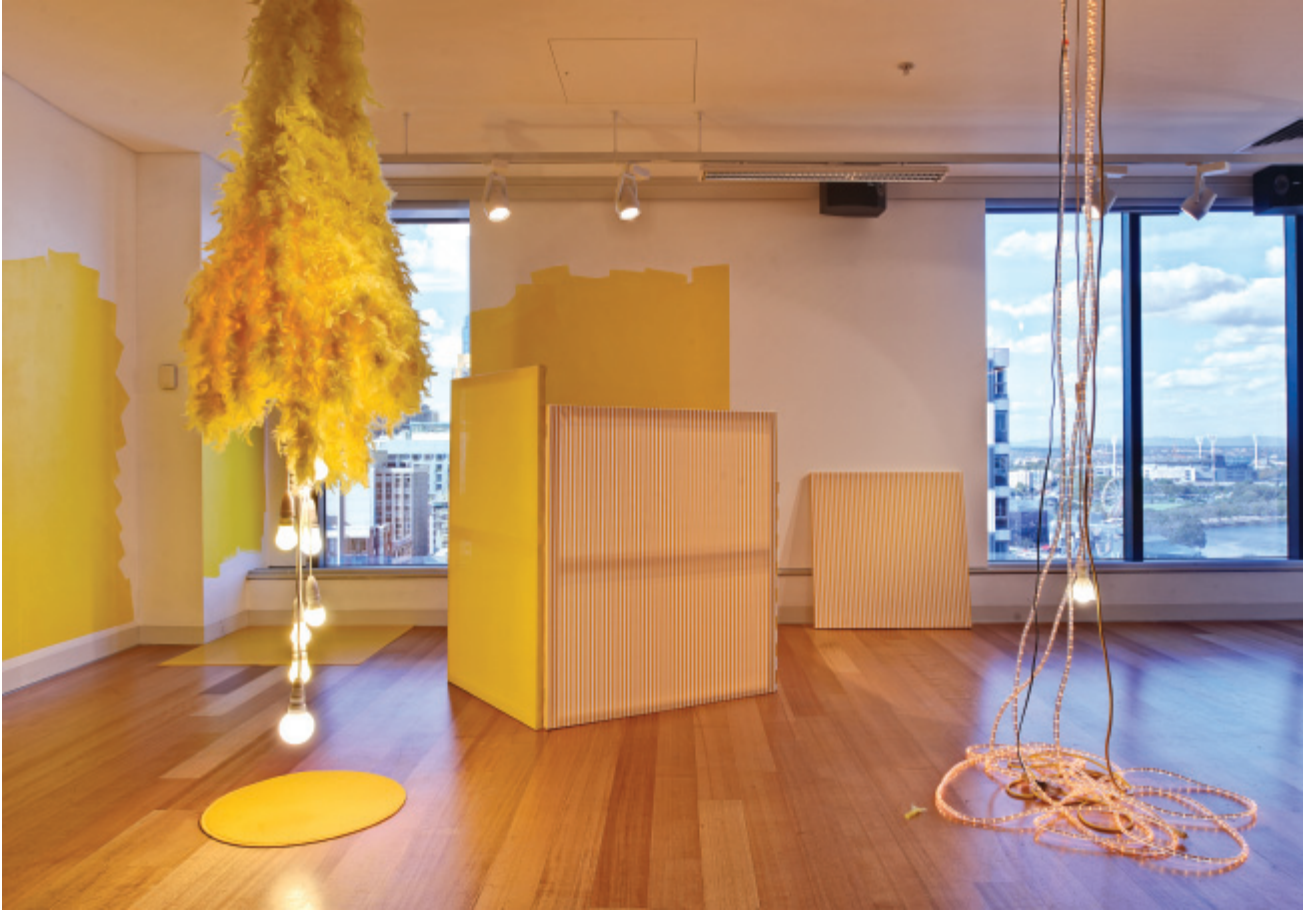
fragments from yellow (Level 17 Artspace) 2010