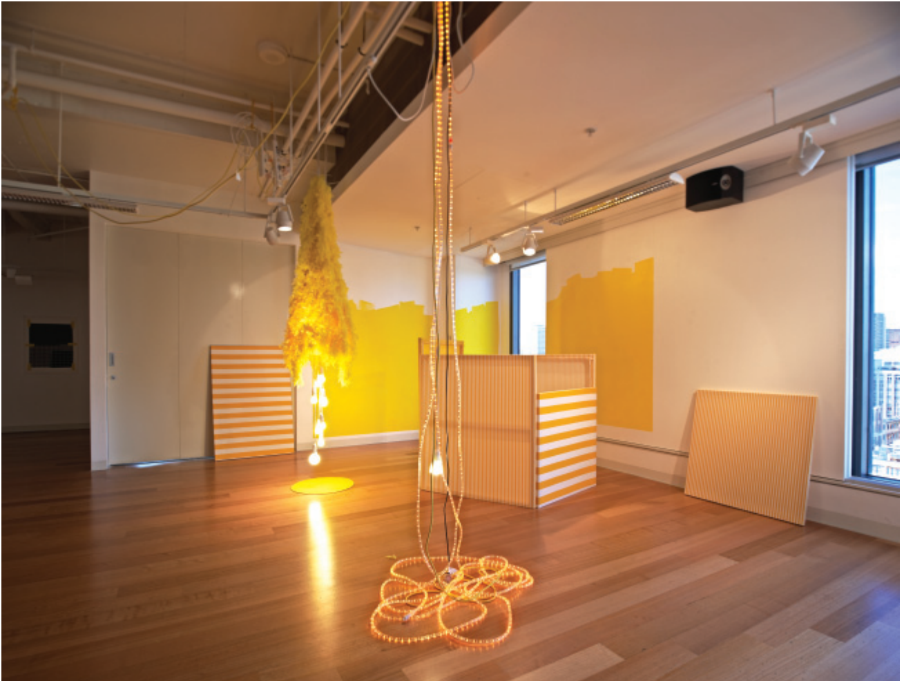
fragments from yellow (Level 17 Artspace) 2010