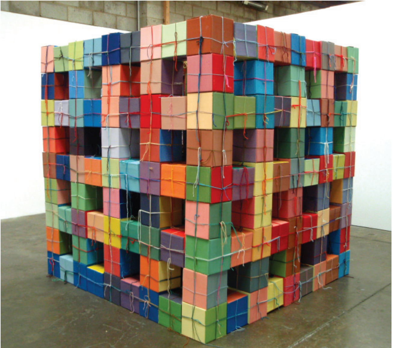
Large Cube 2009