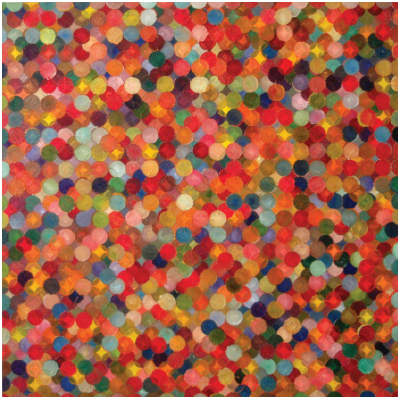
Circle Painting 2010