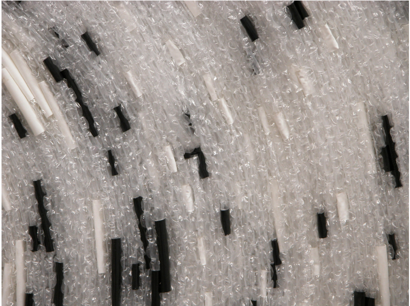
Large Circle detail

evolves from the innate properties and structures of the material itself. Large sculptural wall works, each made to a particular random system, combine with black shiny intricate small bamboo mats grouped together mimicking tessellation patterns. As in previous work, materials are the driving force behind Sarroff's work. Some materials are manipulated by intense process as demonstrated in this exhibition. But also, some are left in their original state, such as the carefully stacked, cellular like, psychedelic pink plastic containers that could be indicating scientific or biological things.