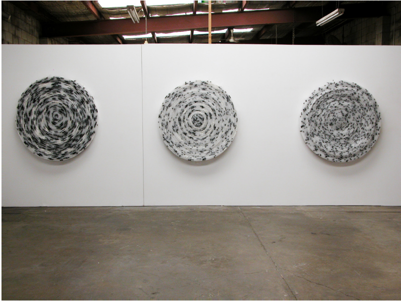
Installation Large Circles 2009 Bubble wrap, tape, staples 120 x120 cms x 8 cms each

Patterns of Probabilities explores ideas relating to REALITY and how we perceive it. The main inspiration comes from an ongoing research into the interrelationship between Physics and the world around us. Probabilities are determined by the dynamics of a whole system. Investigations reveal the opportunities for a vast array of variable configurations and arrangements. Many separate parts come together as a whole and at a later date are reconfigured into different patterns. Sarroff indicates how the whole becomes not only more than, but very different from, the sum of its parts. Impermanence is everywhere and everything is in flux, patterns emerge only to be rearranged into a new dynamic.